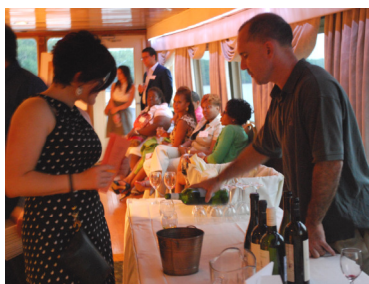
Wine sampling with local wine representatives

No one could rain on OPP’s parade! Sip ‘n’ Sail 2011 helped OPP raise more than $80,000 to support programs and