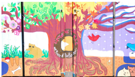
Outdoor mural located at YWCA Hartford Region: The Growing Tree Learning Center

While for many people, summer signifies a period of relaxation and a time to get away, it is typically one of our busiest times of the year at OPP. We look forward to summer just as much as the youth going on school vacation. With many youth wanting to participate in programs through OPP, including its Youth Businesses and area internships, it's no wonder that OPP's halls were flooded with youth this summer.