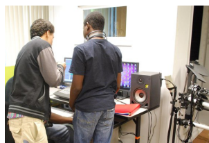
Youth producing music for the song to be featuring in their music video